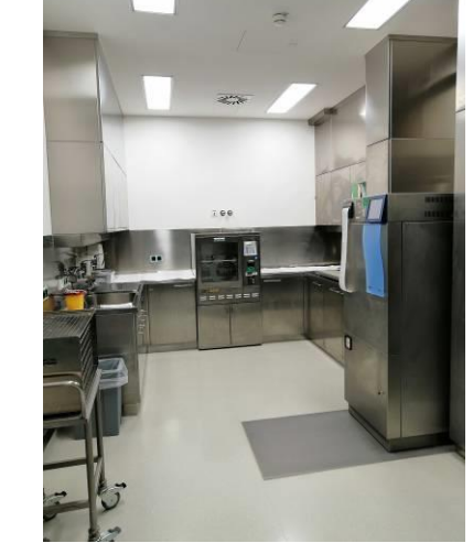
Room for sterilization and preparation of surgical instruments