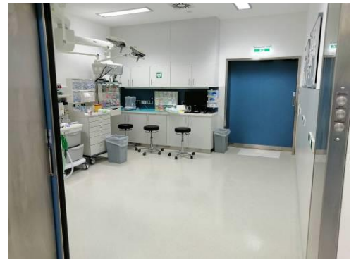
Section for processing samples taken during the operation