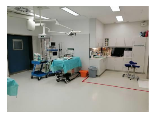
Clean and dirty area for preparing animals surgery