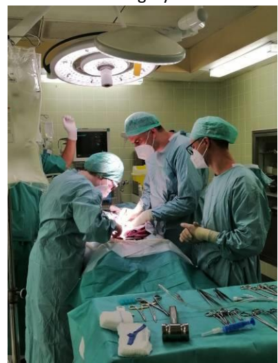
Organ harvesting surgery